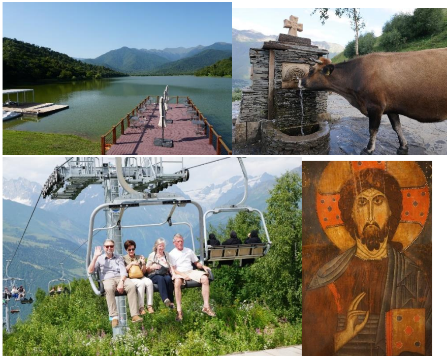
Figure 19: brand new and well developed tourist infrastructure