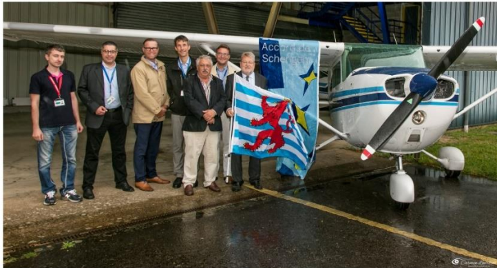
The former Minister of the Building, Transport and Economy of Luxembourg, Mister Robert Goebbels (also known due to the signature of the Schengen treaty) and current member of the European Parliament, gave the official start for the rally to Georgia with the luxembourg's "Red Lion" flag.

The rally shows the clear advantages that the Schengen agreements has brought to aviation. People sometimes take it for granted. Travelling outside of the “Schengen area” was like returning in time as we have been losing many hours with customs. The red tape we encountered outside of the Schengen area was quite disturbing. Schengen is an absolute benefit for European pilots.