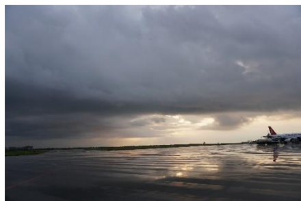
Figure 6: landing in subtropical Batumi in bad weather conditions

Our pilots have been prepaying for AVGAS, which was brought in barrels on the back of a car and served with a handpump from the Vanilla Sky team. The good teamwork with the Georgian Vanilla Sky management made it possible that we were delivered with quality AVGAS (imported from Holland) all along our route in Georgia