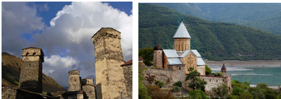
Figure 13: the tourist program that was developed together with Vanilla Sky showed all the best that Georgia has to offer