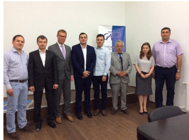
Figure 1: first meeting with Georgian State Minister David Bakradze in his Tbilisi office in 2015