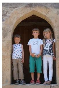
Figure 16: we had several children who joined us for the tourist program