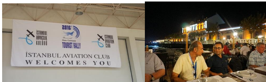
Figure 4: warm welcome reception in Turkey (Bursa Yenişehir Airport Turkey LTBR)