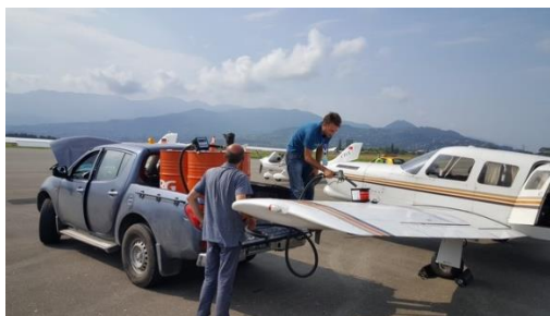
Figure 7: AVGAS delivered in barrels / handpump