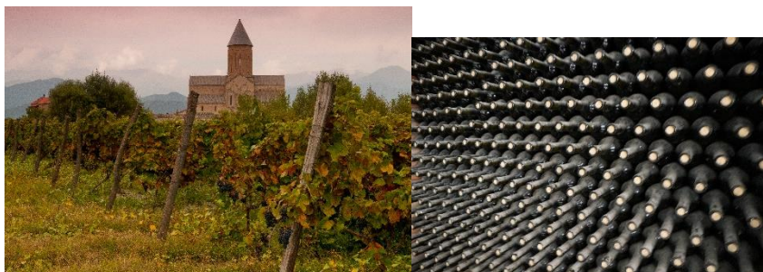
Figure 17: vineyards with a Tuscany feeling