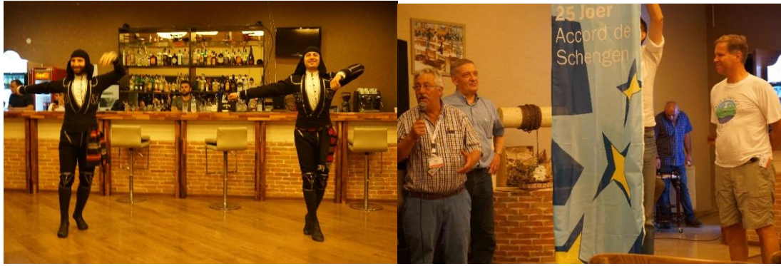
Figure 8: Welcome party with dance and music organized by the airfield of Natakhtari