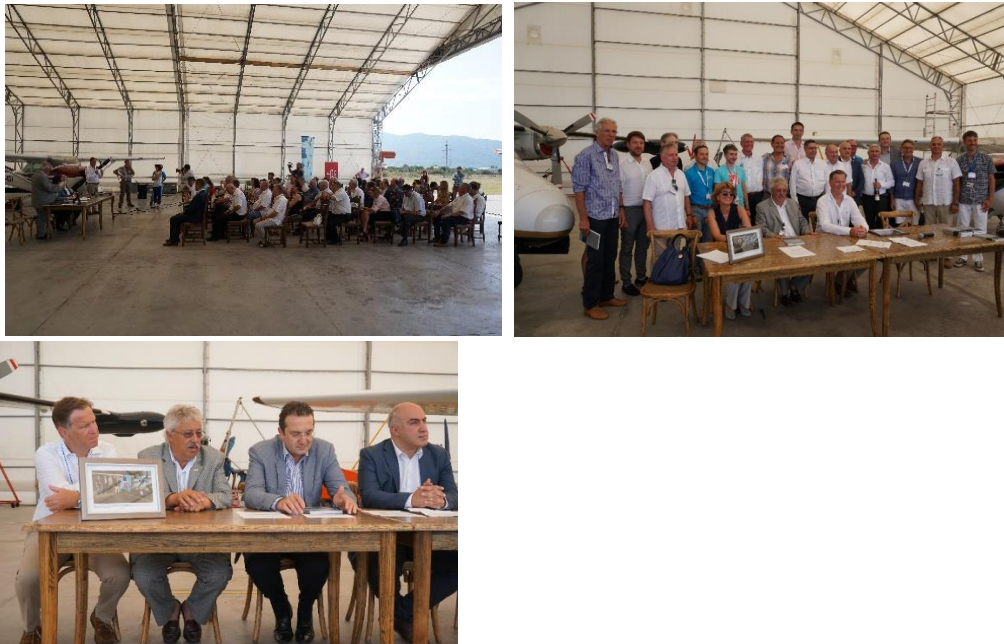
Figure 10: more than 100 people at the formal event that Georgian authorities organized with Vanilla Sky

We distributed the rare bottles of “Chateau de Schengen” wine we brought from Luxembourg. This was highly appreciated as Georgia is preparing to join the European Union